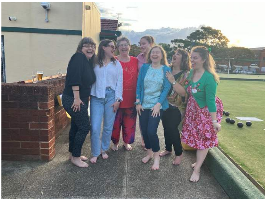
ARTA aged care interest group goes barefoot bowling for our Christmas catch up!