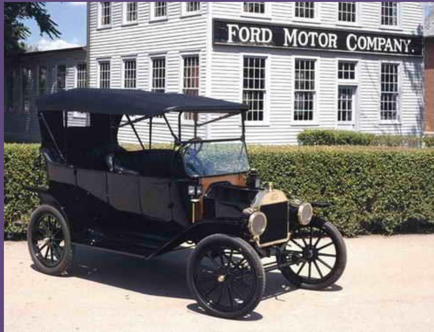
A four door Model T Ford

He was not happy when lollies were left under the seat and no one cleaned them up.