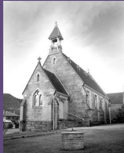
St Peter's Catholic Church New Norfolk